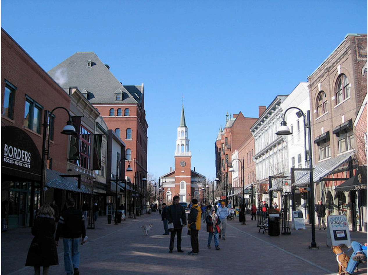
Church Street, Burlington Vermont